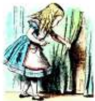
"Curiouser and Curiouser"